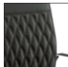
Kruna plus (rhomboidal) R Imbottitura "romboidale" "Rhomboidal" pad