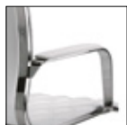
TU..T. Bracciolo cromato, con soprabracciolo imbottito Chromed steel, with padded top arm