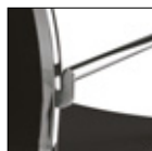
Telaio slitta cromato Chromed sled frame