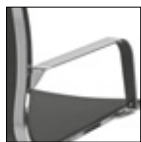
KU..C. Bracciolo cromato Chromed steel