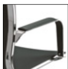
KU..P. Bracciolo cromato, con soprabracciolo poliuretano nero Chromed steel, with black polyurethane top arm