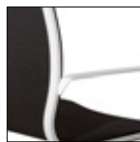
Telaio e braccioli verniciati bianco White painted frame and arms