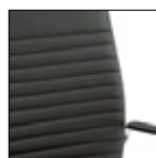
Kruna plus (linear) L Imbottitura "lineare" "Linear" pad