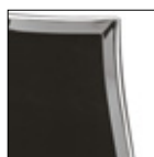
Telaio cromato Chromed frame