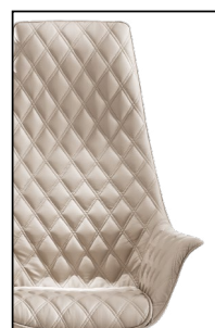
Particolare imbottitura romboidale "Rhomboidal" pad detail