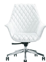
Imbottitura "romboidale" "Rhomboidal" pad

... raffinato design per l'ufficio presidenziale. ... refined design for managerial office. ... d'un design raffiné pour bureau de direction ... raffiniertes Design geeignet für Chefsbüros ... diseño refinado para la oficina de dirección.