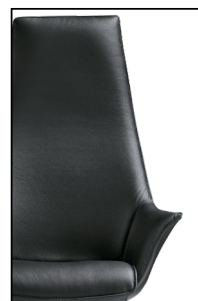
Particolare imbottitura liscia Flat pad detail