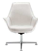
Imbottitura "liscia" "Flat" pad